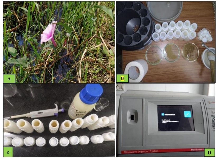
Figure 2. Ipomoea aquatica Forssk, sample plant (A), Sample grinding (A), Preparation for sample digestion (C) and Microwave digester (D).

in I.aquatica was in the order of Ni > Cr > Li. The recorded lithium (Li) concentration was 0.263\pm0.067 mg/kg dry weight, with a minimum value of 0.133 mg/kg and a maximum value of 0.395